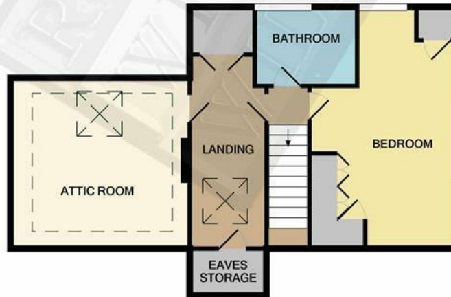
1ST FLOOR APPROX. FLOOR AREA 527 SQ.FT. (49.0 SQ.M.)